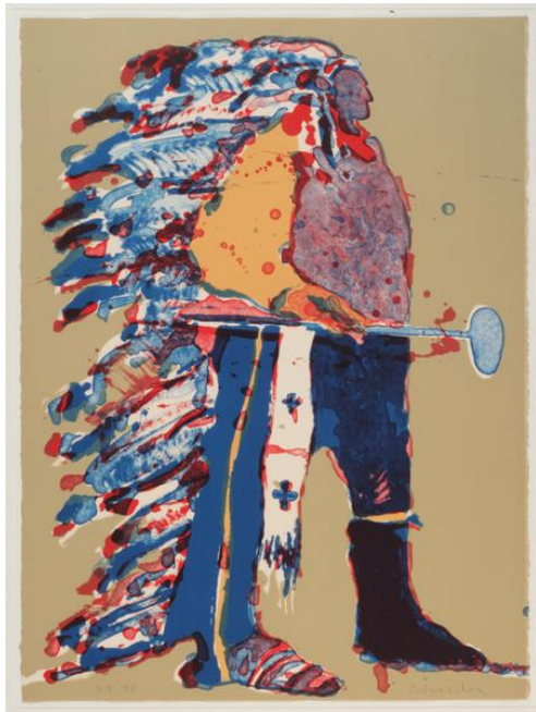
Indian with a Tomahawk Lithograph on paper, 1975 Fritz Scholder

Many artists such as Albert Durer, Francisco Goya, Pablo Picasso, Henri de Toulouse-Lautrec, Roy Lichtenstein and Andy Warhol used some form of print making as an extension of their art.